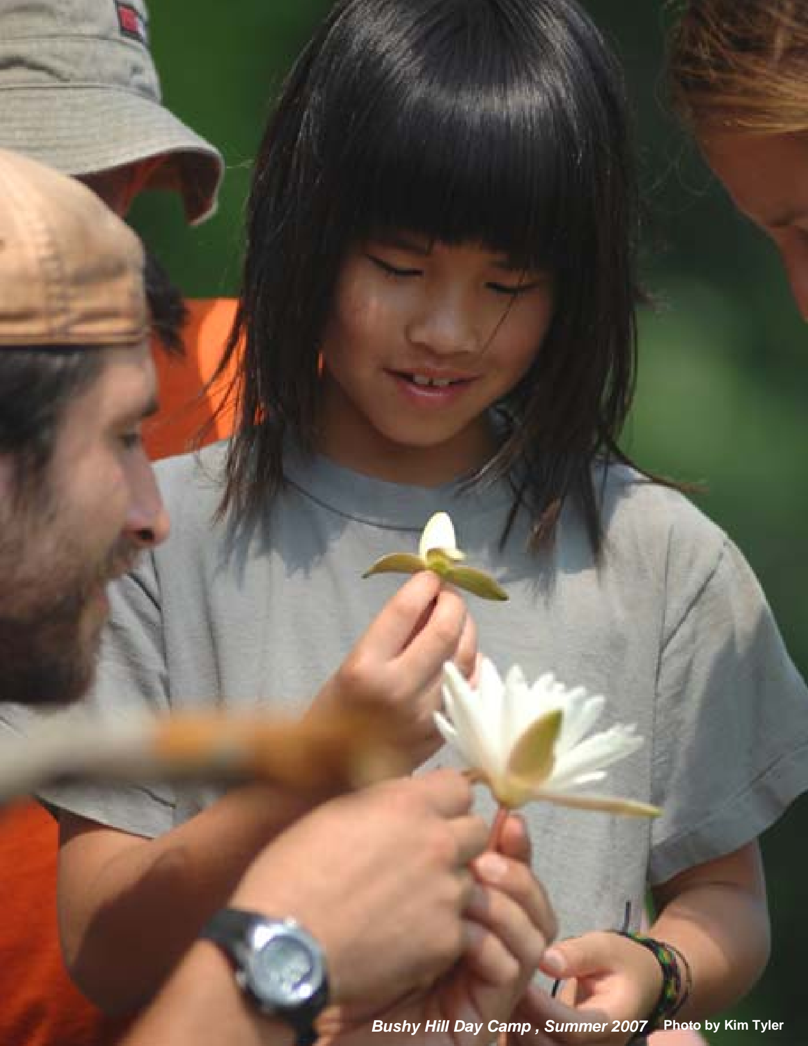
Bushy Hill Day Camp , Summer 2007