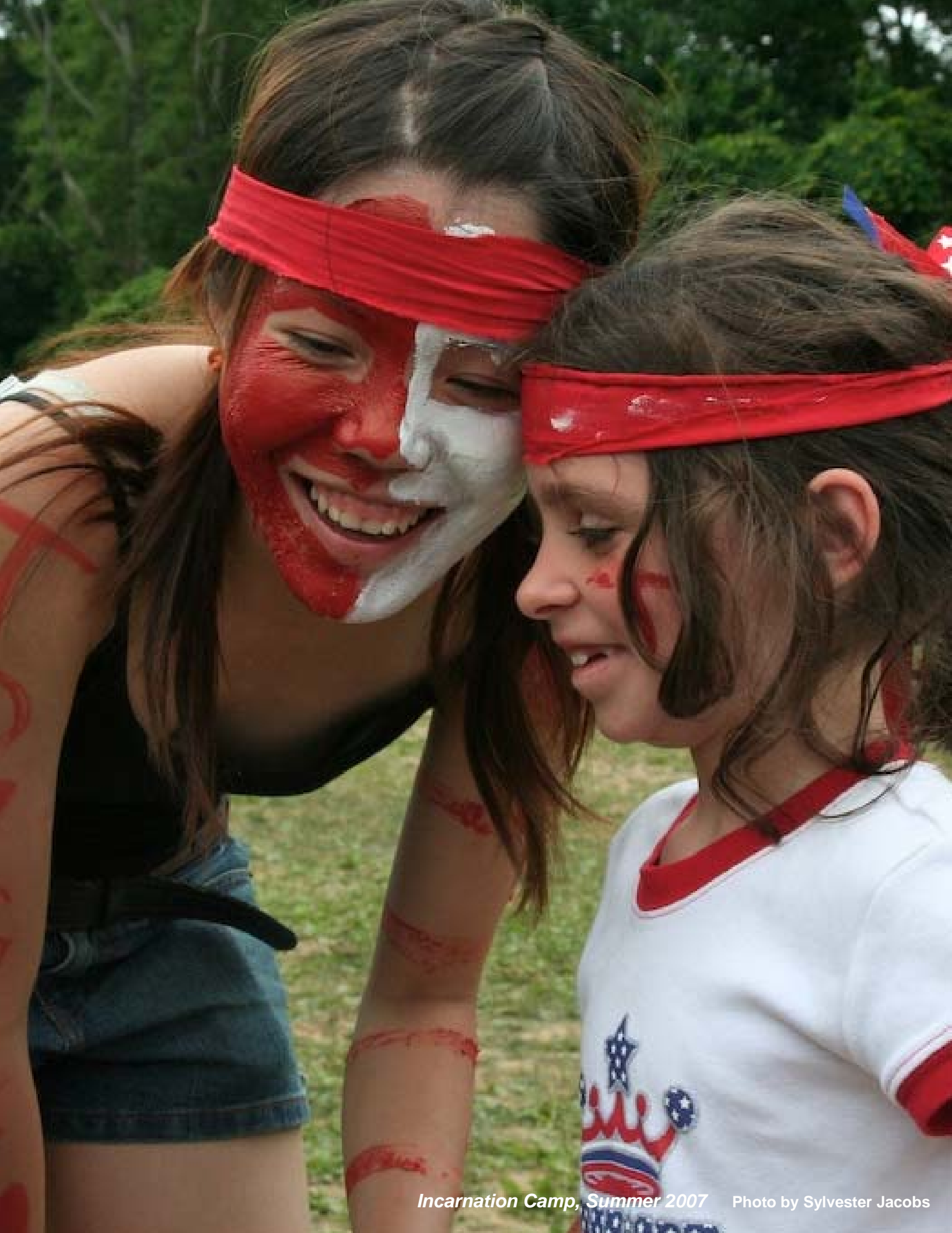
Incarnation Camp, Summer 2007