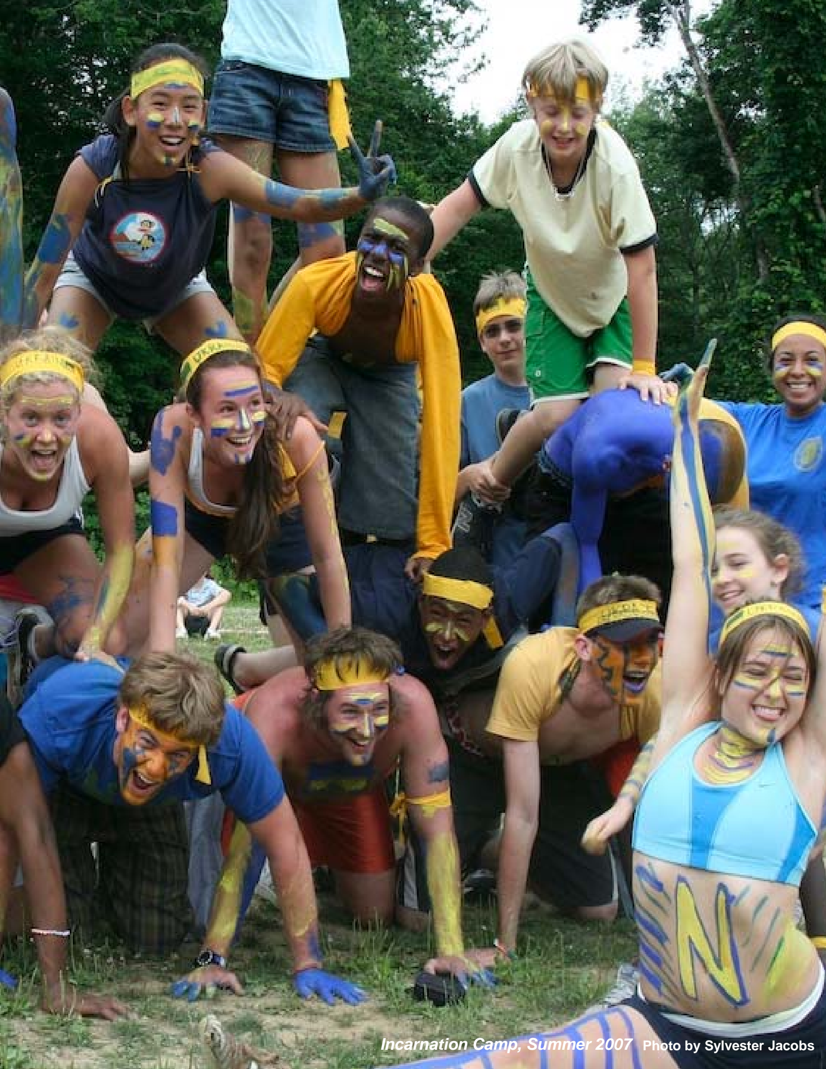
Incarnation Camp, Summer 2007