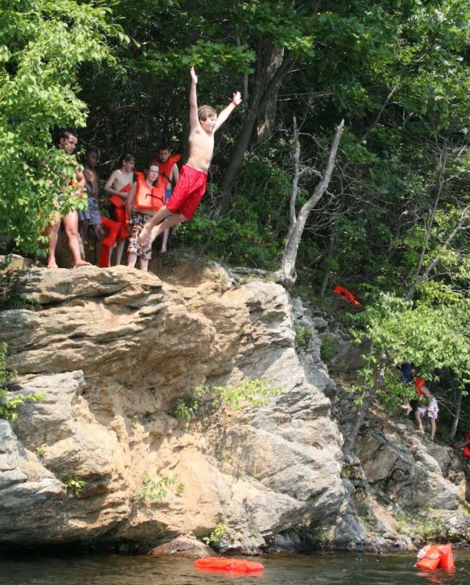
Incarnation Camp, Summer 2007